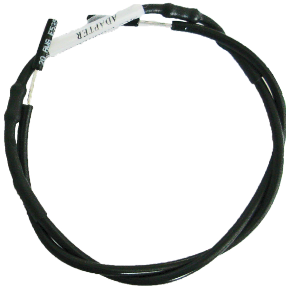
Part # MCS-CARRIER-5K-ADAPTER